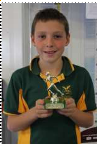
Edward Bartram Trophy Presentation for DPS Athletics 2024 Cross Country Champion